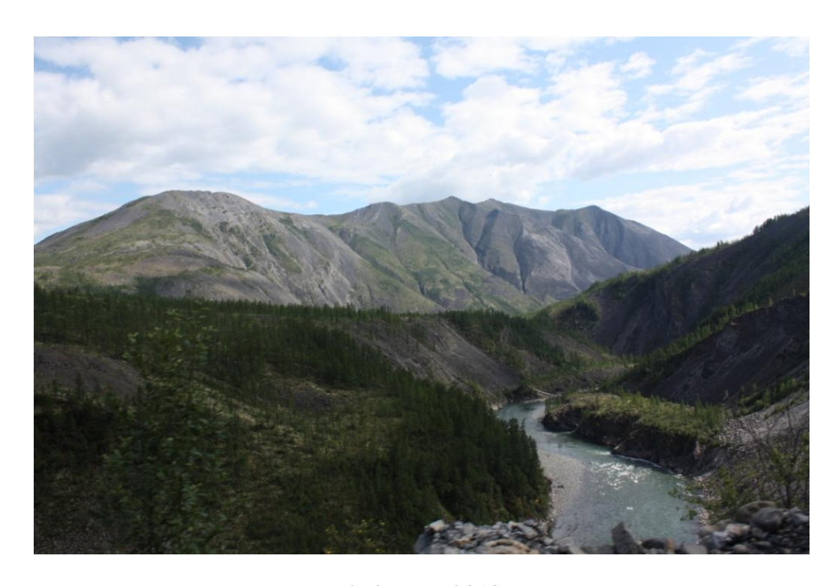
4- 8 June, 2018 Yakutsk, the Republic of Sakha (Yakutia), Russian Federation

III<sup>rd</sup> scientific-practical conference "Prospects of phyto-biotechnology for improving the quality of life in the North" with international participation and a scientific school on cell biotechnology